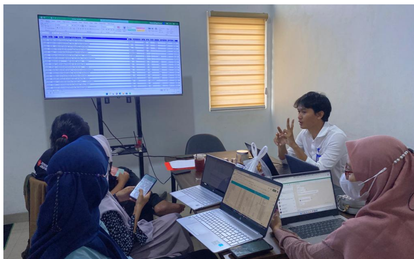
Figure 1. Explanation of Budget Plan Preparation and Discussion with Partner

At the implementation stage, the community service team provided material briefings related to budget planning. The team explained the budgeting cycle, capital budgeting, forecasting techniques, Microsoft Excel – spreadsheet: the basic purpose of a spreadsheet program, and Microsoft Excel forecast techniques in making budget plans using simple linear regression and seasonal budgeting methods. Then, the community service team provided discussion sessions as an opportunity for partners to discuss how to prepare budget plans to help them determine financial management policies and improve performance at PT Zerone International Industries.