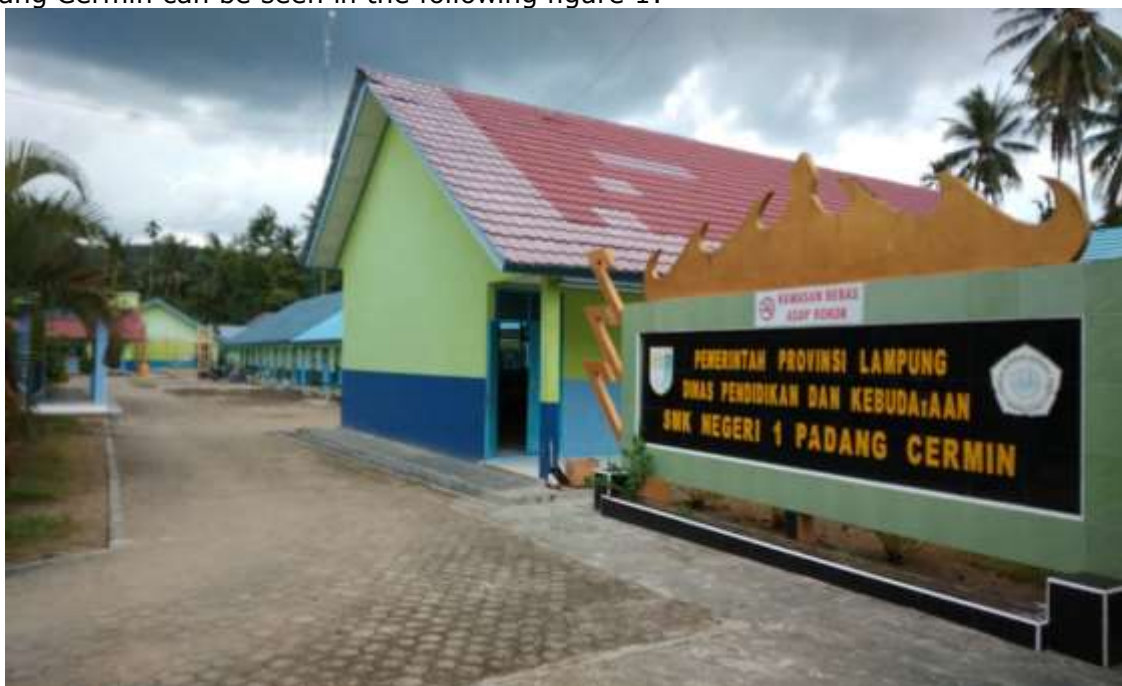
Figure 1. Front Page of SMK N 1 Padang Cermin

The training on the application of Google Sheets was conducted at SMK N 1 Padang Cermin located in Padang Cermin District, Pesawaran Regency. The picture of the front page of SMK N 1 Padang Cermin can be seen in the following figure 1.