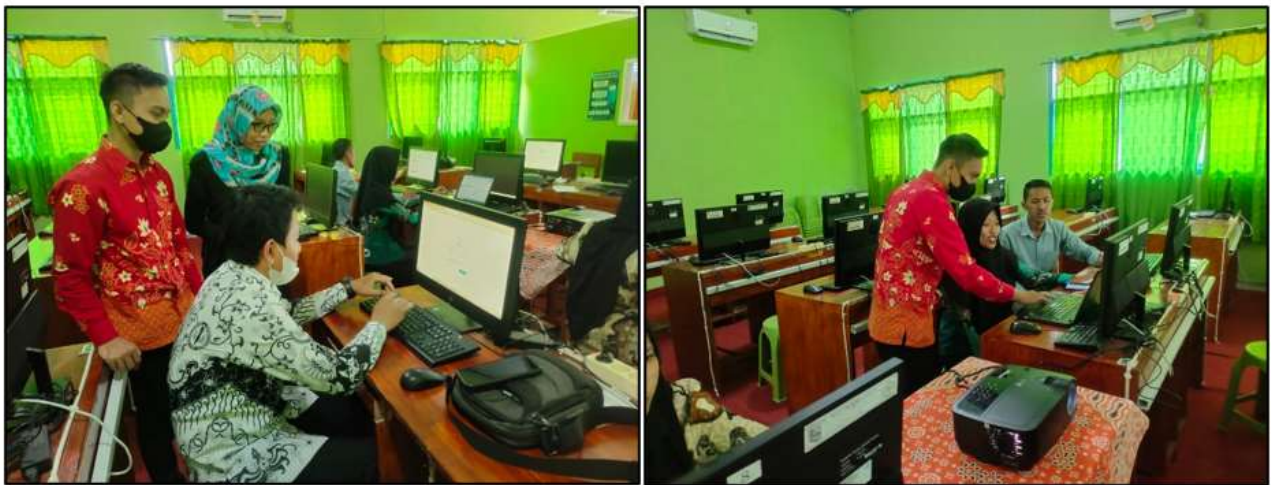
Figure 2. Implementation of Google Sheets training activities for Teachers

In order to provide additional knowledge and competence of teachers in improving the ability to make financial reports using google spreadsheets, the PKM team of Universitas Teknokrat Indonesia held a training on the application of Accurate Accounting Software in the form of practicum which was held at the Accounting Computer Laboratory of SMK N 1 Padang Cermin on April 14, 2022. Training for teachers in the use of Google Sheets for financial report management, in this stage is carried out in the form of providing training for teachers to utilize Google Sheets in managing financial statements. All activities carried out by the proposing team in this community service program are inseparable from the role and participation of partners, in this case partners play an active role in the activities of each implementation from planning for making applications, using applications, and testing digital libraries whether they are in accordance with what is expected until the final stage, namely evaluating the achievement of the results of the activities carried out.